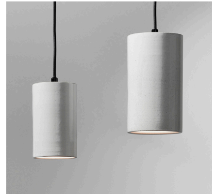
Earth Light, Pendant, Regular and Large – Speckled White Gloss