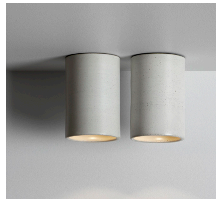
Earth Light, Ceiling Mount – Speckled White Satin

The Earth Light has been designed in wall, pendant and ceiling mount formats. The elemental geometric form is both simple and architectural; all fittings are thrown on a potter's wheel giving each light a unique quality and a surface rich with the evidence of its handmade process.