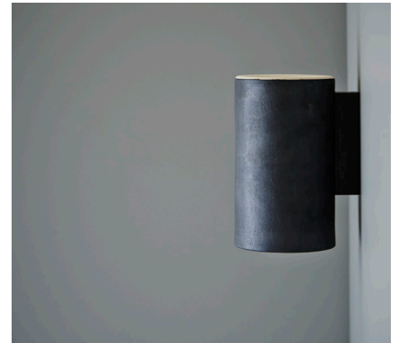
Earth Light, Wall Mount, Regular – Charcoal