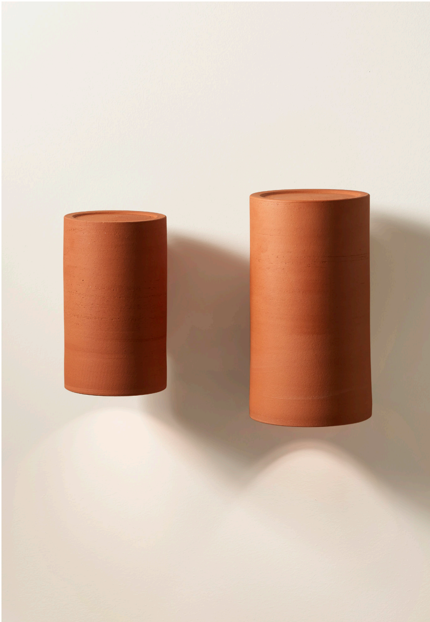
Earth Light, Wall Mount, Regular and Large – Terracotta