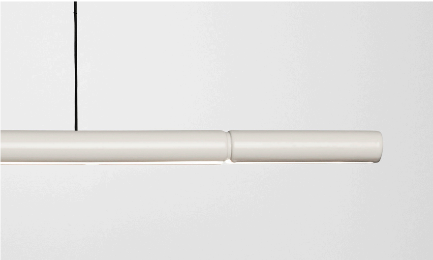
Potter DS, Pendant, 1800 – DS White