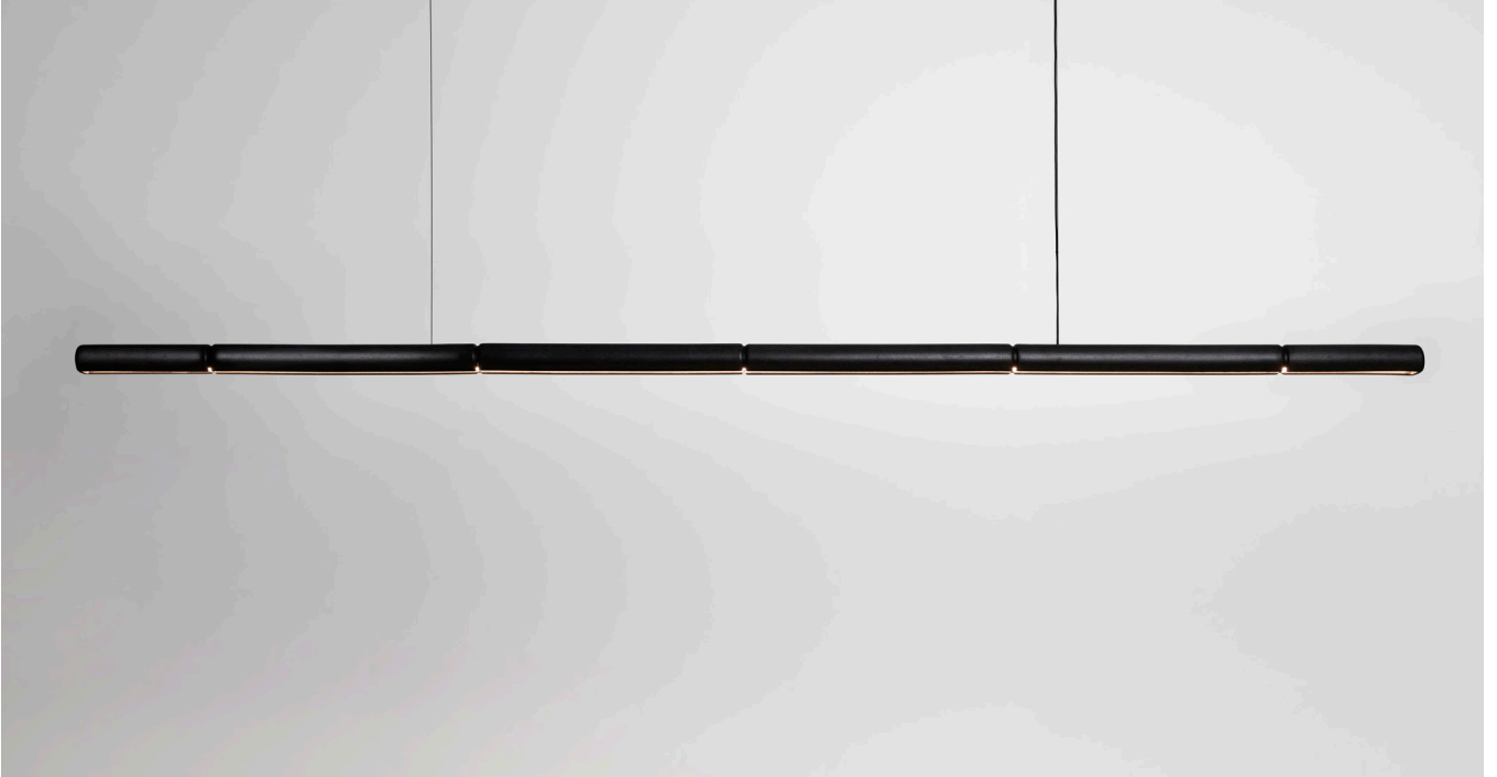
Potter DS, Pendant, 2250 – DS Charcoal