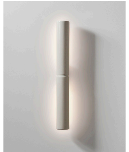
Potter DS, Wall Mount – DS White

Designed by Bruce Rowe for Anchor, the ceramic Potter DS wall and pendant lights are the outcome of a creative and technical collaboration with our long-term lighting partner, Rakumba Lighting and master potter, Michael Skewes. Designed and made using a hybrid process of traditional ceramic techniques and contemporary digital tools, the DS is simple and refined, focusing on the essential beauty of the ceramic form to direct and reflect light. The external simplicity of the handmade ceramic form houses integrated aluminium and acrylic extrusions and a resolved LED lighting solution.