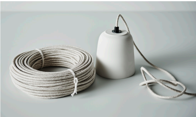
Flex Option – Natural Grey Linen