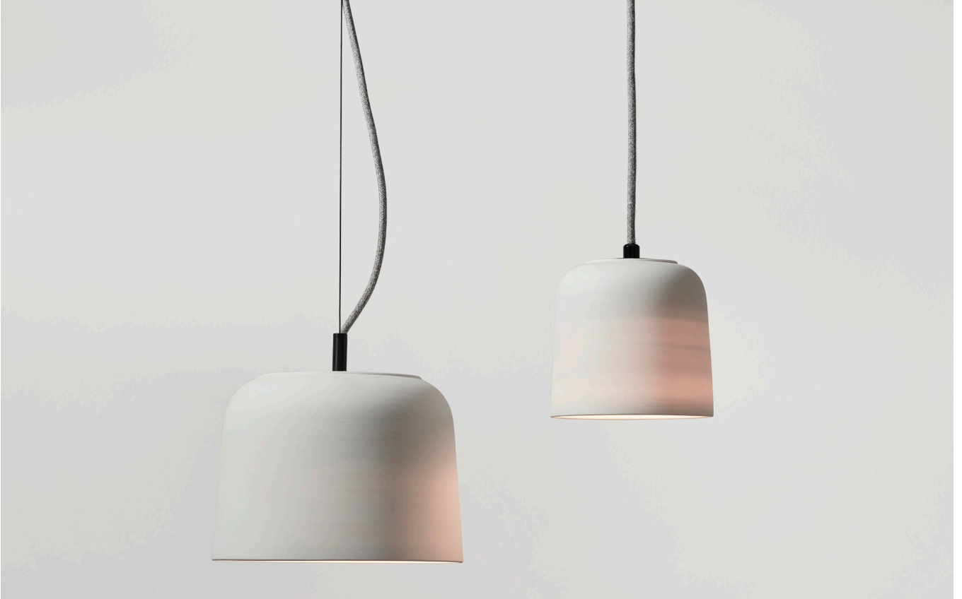
Potter Halo, Medium and Small – Porcelain