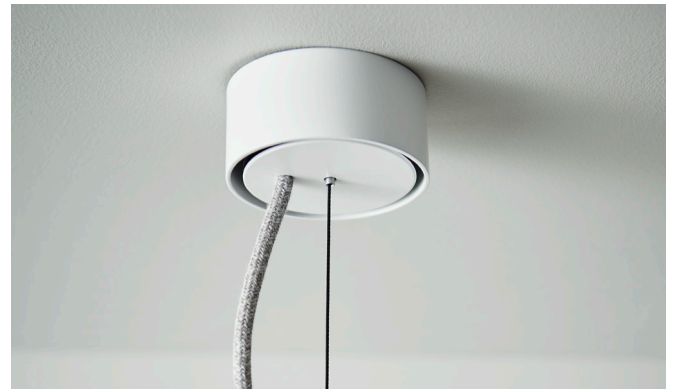
White Ceiling Canopy, Flex Option – Mid Grey Linen

Handmade to the same size and shape specifications as the other fittings in the Potter Light family, the Potter Halo is thrown on a potter's wheel using a specially formulated, high-grade porcelain. Sourced from a producer in Australia, the porcelain used to make the Potter Halo is internationally regarded as one of the finest in the world. Its highly refined nature produces a semi-translucent surface that glows softly when illuminated from within.