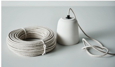
Flex option – Natural grey linen