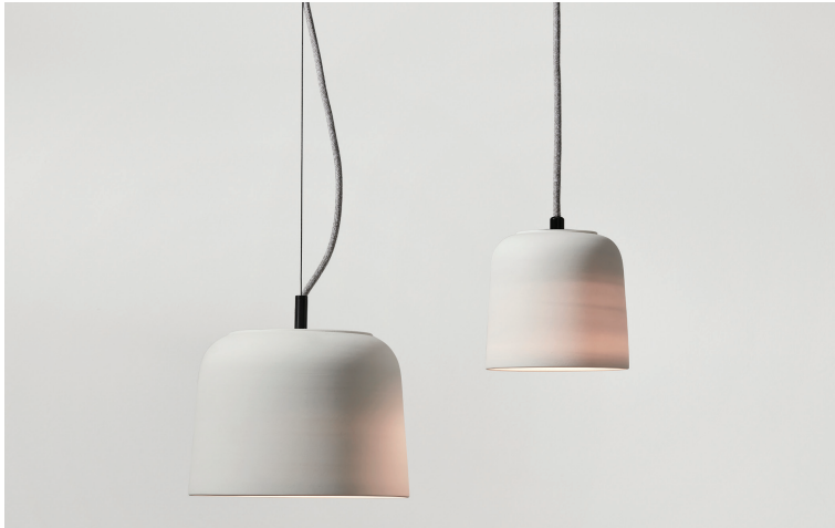
Potter Halo, medium and small