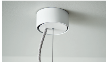
White ceiling canopy, flex option – Mid grey linen